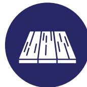
Realistic oak looking