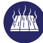
Suitable for subfloor heating