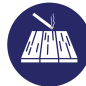
Cigarette burn resistant